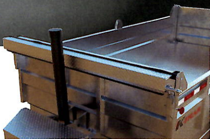
STANDARD TARP PROTECTOR

3" x 8" x 3/16" tubing frame. 1/8" steel unibody design. C3 cross members every 16" C/C. Steel diamond fenders. Welded footsteps